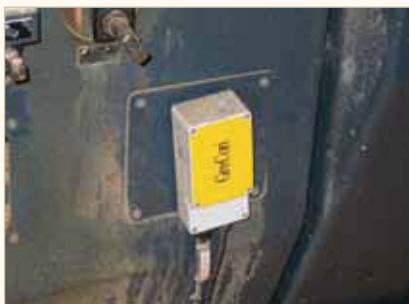
Monitored interior space of the planer

By means of a GreCon early fire detection, combined with automatic extinguishment systems, this risk of fire can be effectively met. Besides spark extinguishment within the exhaust pipes, a water extinguishment, which stands out due to minimum water consumption due to a new water spray technique, is also used in the planer cabin or in the covering hoods of the planer or in the bottom engine bed.